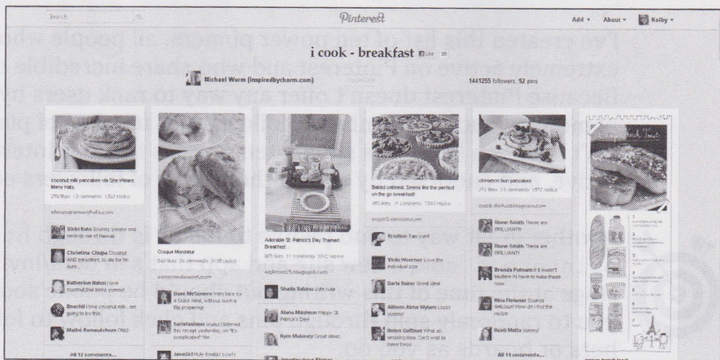
Figure 12-2: Michael Wurm's breakfast board.

His boards focus primarily on food and design, with several boards dedicated to one or the other. He has one board with great ideas and recipes for the first meal of the day, I Cook – Breakfast, that you can find at http://pinterest.com/inspiredbycharm/i-cook-breakfast/ . (See Figure 12-2.)